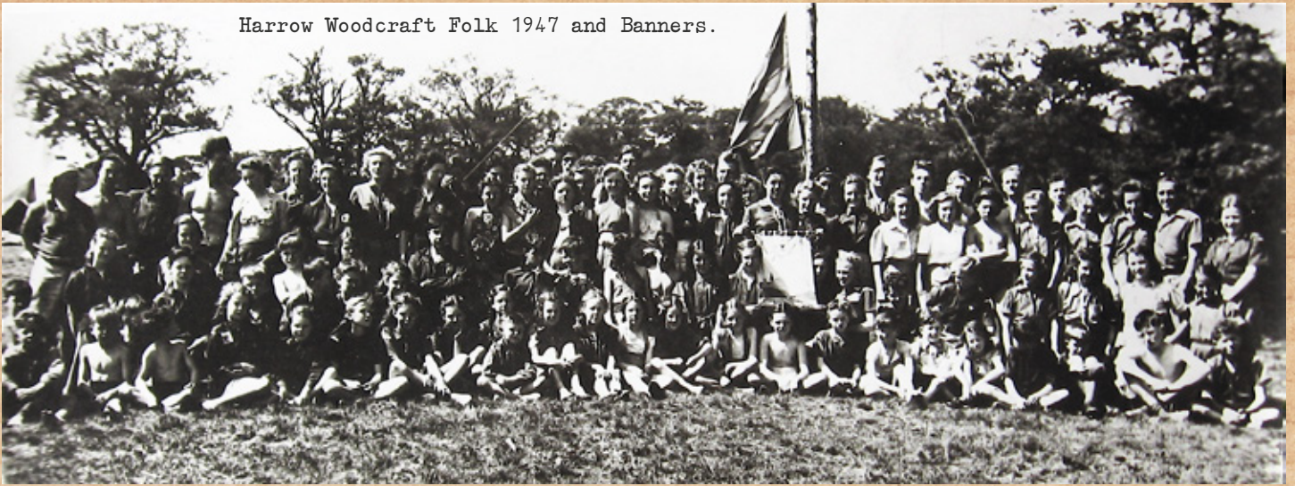
Harrow Woodcraft Folk 1947 and Banners.

With the return of the Folk members from the armed forces Harrow Woodcraft Folk saw an increase in group openings. Which gave rise to the District being called Stanharken Thing. (The word 'Thing' being an old Anglo-Saxon word for a joining together of groups. The groups being in Stanmore, Harrow and Kenton).